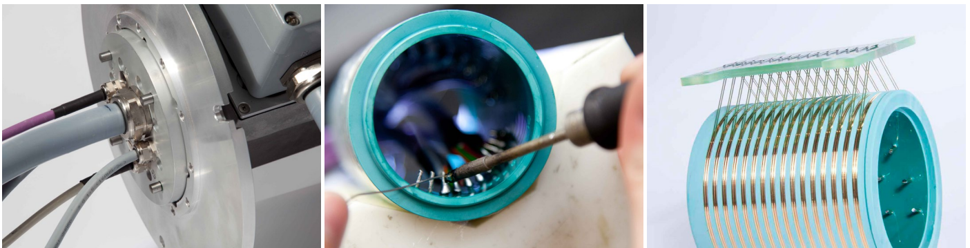
► Wind slip ring ready for shipment; steps in the manufacturing process; module with brush block

Hybrid rotary joints that combine several of the technologies mentioned are also offered under the brands mentioned. The same applies to individual components of the named rotary joints such as slipring brushes, brush blocks as well as semi-finished products and modules.