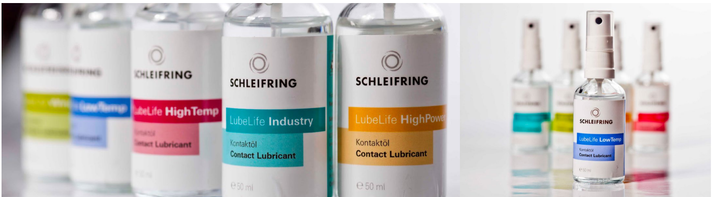
► LubeLife contact oil in spray bottle

LubeLife is the brand of Schleifring GmbH for high-quality coating agents and cleaning agents. Whether lubricating or cleaning, spraying or wiping, our LubeLife oils and coatings offer reliable protection against corrosion and reduce abrasion.