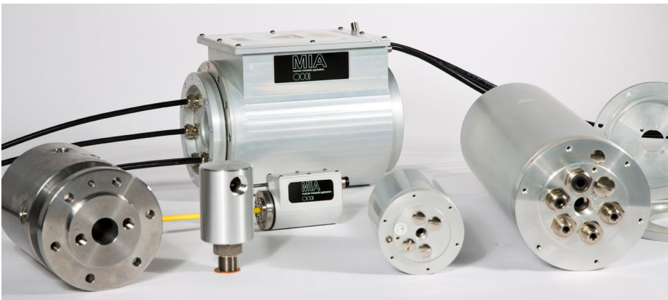
► MIA – Custom configured rotary joints

MIA is state-of-the-art development service for our customers from Schleifring GmbH and the corresponding rotary joints. Depending on the customer's requirements, MIA rotary joints allow the transmission of solid, liquid and gaseous substances (media) between countermoving parts and, in particular, rotating parts.