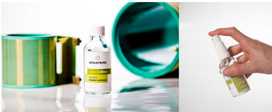
► LubeLife contact oil for the maintenance of rotary joints

Contact us – contact details can be found at the end of the brochure.